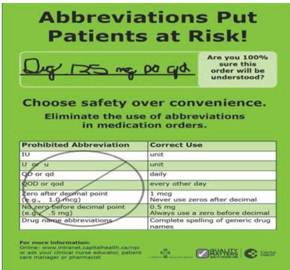
Appendix 1. Poster for unit-level display. © 2005–2012 Alberta Health Services. Reproduced with permission.