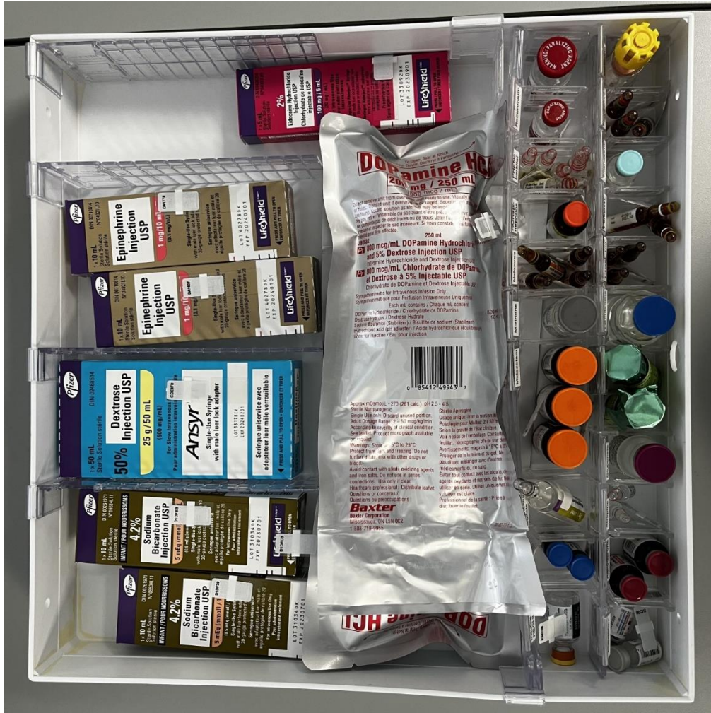
Figure B1. Medication tray.